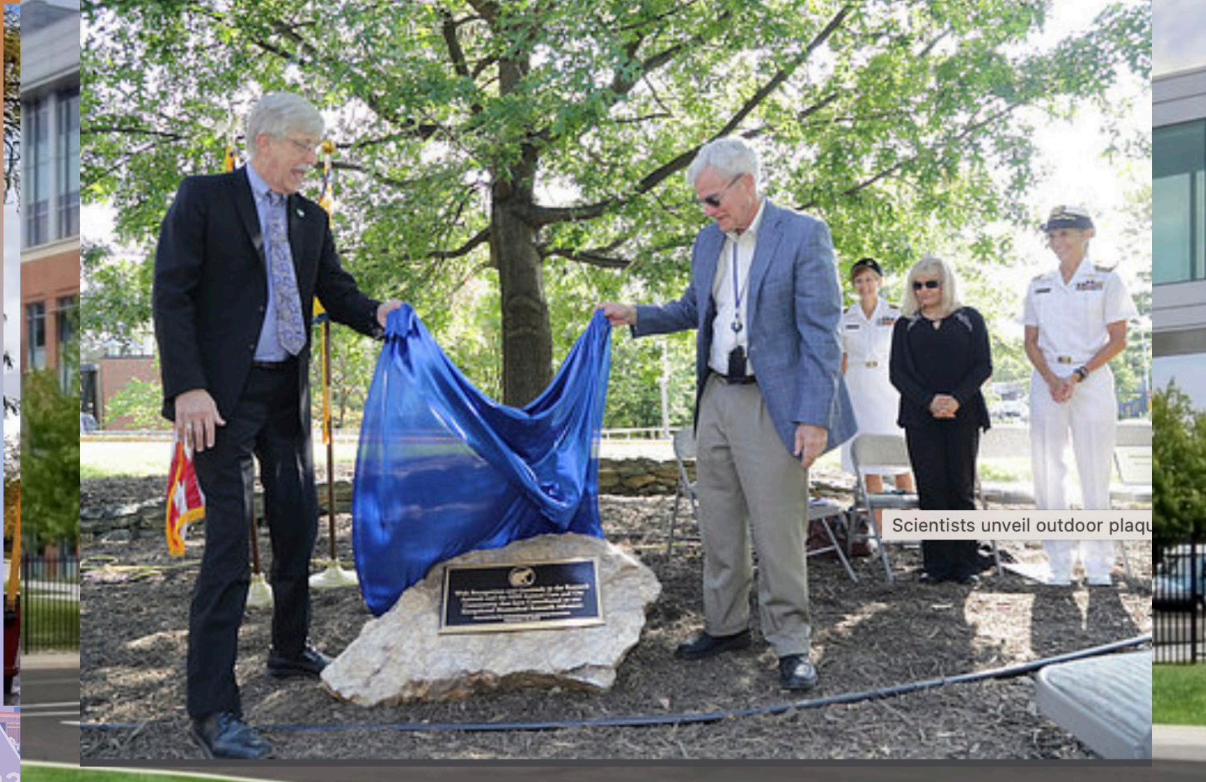
Scientists unveil outdoor plaque