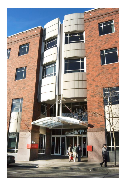
Entrance to one of the UWMC - Roosevelt clinic buildings.