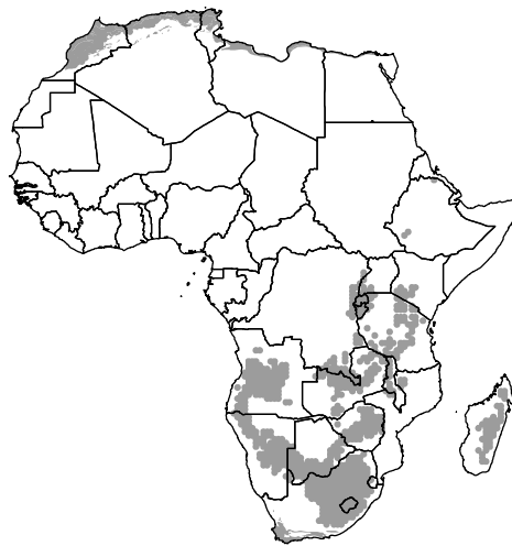
Figure B.1: African Territory Suitable for Large-Scale European Settlement

Three main considerations motivate why this is a reasonable instrument for studying the effects of colonial liberation regimes. First, all components of the instrument are exogenous in the sense that they are not caused by political factors that could affect regime durability. Importantly, the tsetse fly data comes from Alsan’s (2015) tsetse fly suitability index—which is derived from historical climate data—rather than from colonial or post-colonial maps of tsetse fly prevalence, which may be affected by climate change or by stronger states better able to control the fly (389). We also estimate models with various pre-independence covariates (logged population density in 1800, whether any ethnic groups in the country had a precolonial state, index of rugged terrain, colonizer fixed effects) to account for additional sources of heterogeneity. We use these rather than the more standard (relative to the literature) set of covariates used in Table 3, which are mostly post-independence and therefore inappropriate “post-treatment” controls relative to our instrument. Of course, factors such as historical population density might have also been influenced by the instrument, which is why we also estimate specifications without the covariates.